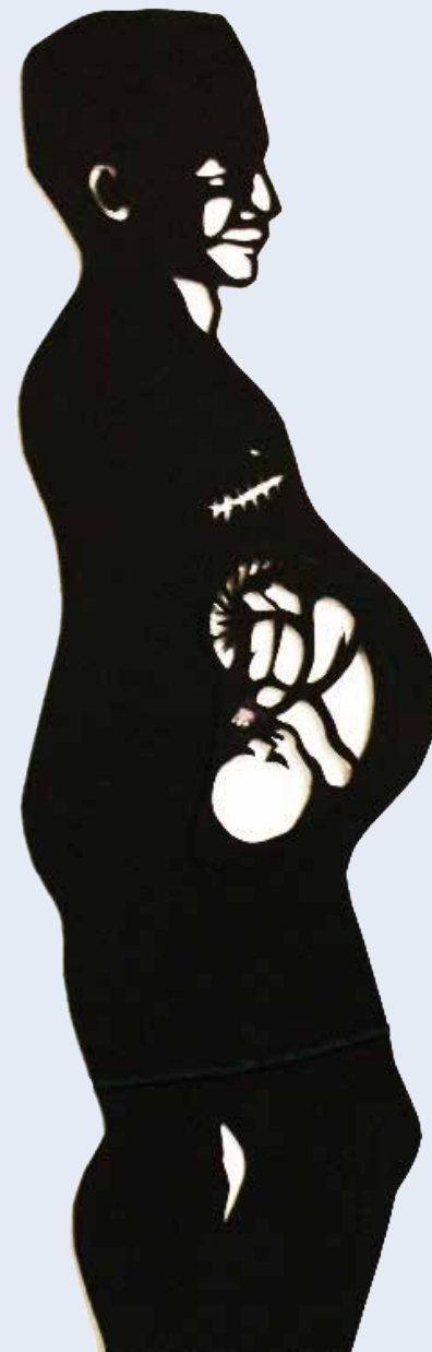
Trans Parent, paper cut-out

The illustration “Fetal Circulation” was a poster submission at the 2014 Association of Ontario Midwives conference, marking 20 years of regulated midwifery in Ontario, and celebrating midwifery’s various longstanding histories.