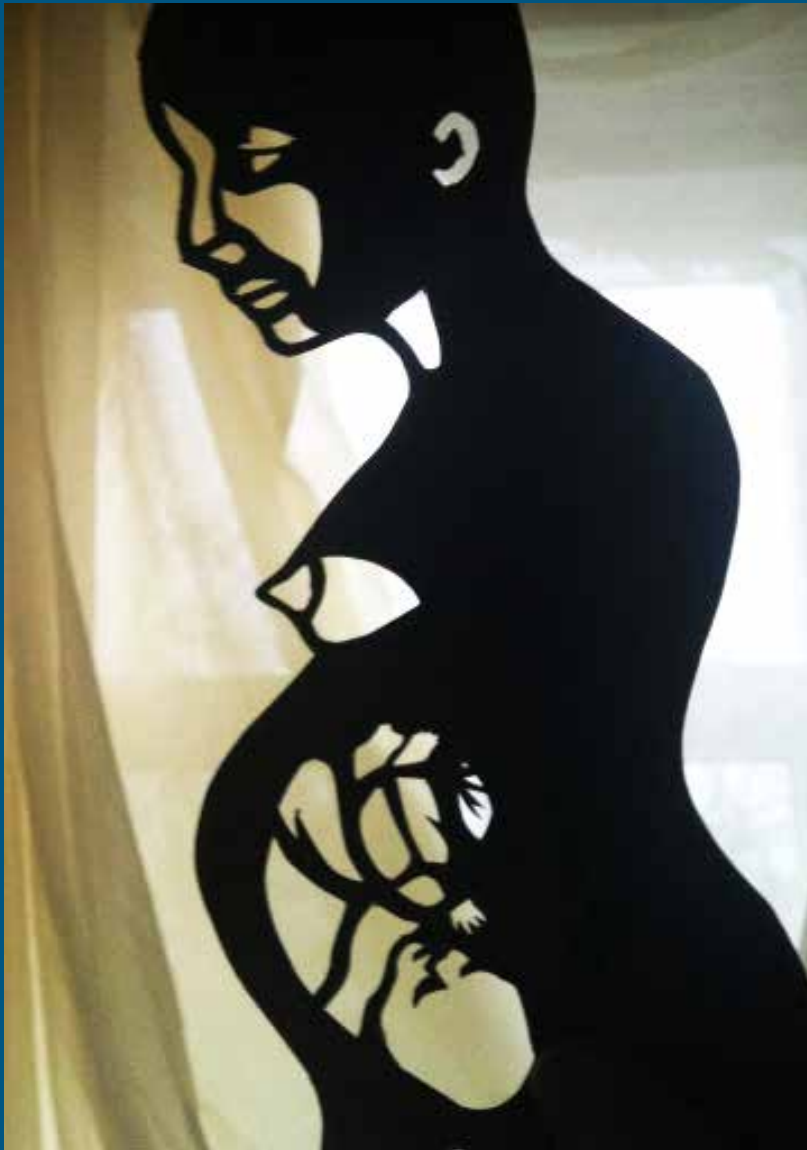
Pregnant in Window , paper cut-out