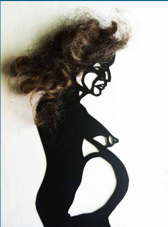
Pregnant, with hair , mixed media