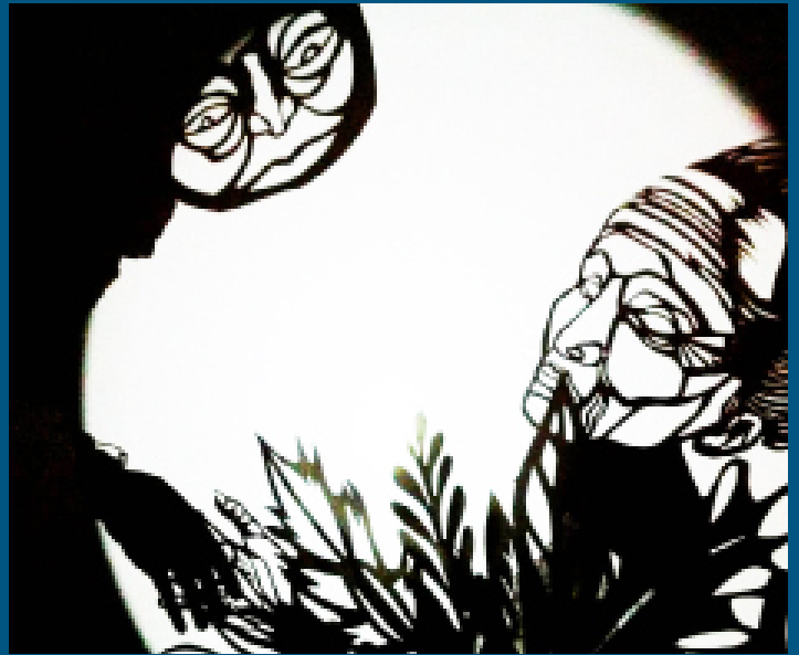
Crone and Moon , paper cut-out, shadow projection