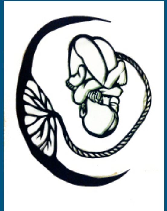
Womb , paper cut-out