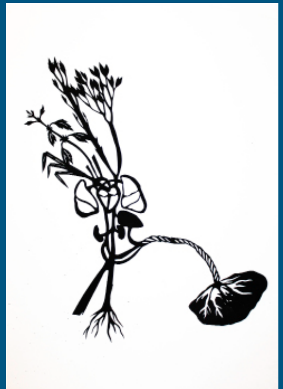
Fetal Circulation , paper cut-out ▶