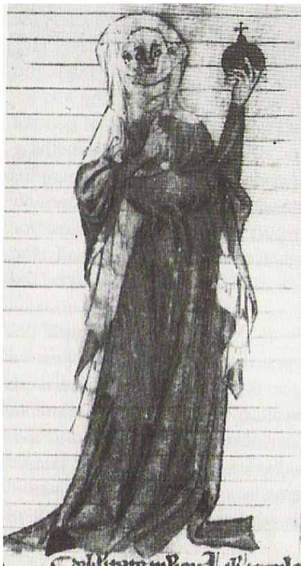
Figure 2: Trotula of Salerno, from an early thirteenth-century

The advancement of the medical science of women's health during this time period was an important contribution to the advancement of professionalism of the field, but its daily practice in western European society sheds a different light on the nature of the midwife. As with many aspects of daily life between the eleventh and thirteenth centuries, the Christian Church was actively interested in every aspect of the childbirth process. St. Hildegard von Bingen, a Benedictine abbess and founder of a successful and popular convent outside of Rupertsburg, Germany between 1098 and 1179, provides an exemplary look at the daily practice of midwifery in medieval Europe, and its place in religious observance. Although monastic life was an accepted alternative for women in the late Middle Ages, it is the way in which a woman chose to focus her Christian teaching and practice that helps to define the fine line between a religious calling and a professional calling. For example, a Christian nun participating in the daily operation of the convent through prayer, ministrations, cooking or study, would be following a path of religious service, while a nun engaged in scholarly writing, public education and medical practice would be considered as having a profession. This is an arguable distinction perhaps, but for the purpose of examining medieval midwives as