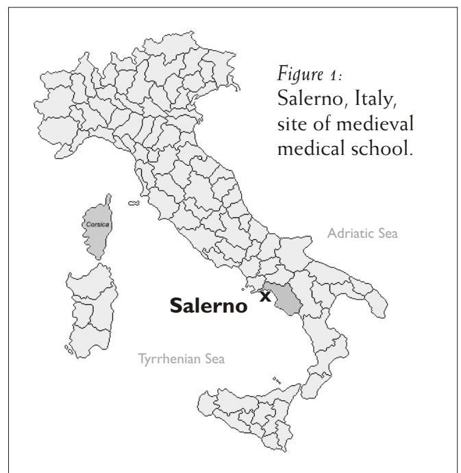
Figure 1: Salerno, Italy, site of medieval medical school.

Trotula's education at Salerno was comprehensive. As both a practitioner and a scholar, she wrote prolifically, resulting in De Passionibus Mulierum , commonly known as Trotula Major or simply Trotula . An English translation of a Trotula manuscript, the Medieval Woman's Guide to Health , is often referenced by medical historians and is the source referenced within this article. ii Most importantly, Trotula perceived herself as a midwife-physician and understood the importance of establishing professionalism in the field of women's health and childbirth, and the need for it to be separate and distinct from other fields of study. In the Preface to her work, Trotula explained why she focussed on this profession and why she felt compelled to advance its